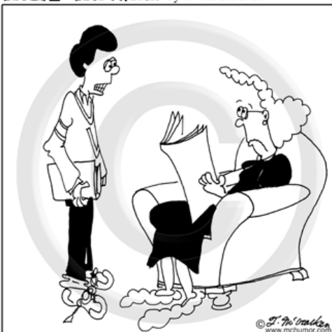
"There was a slight accident in shop class. I welded my braces together."